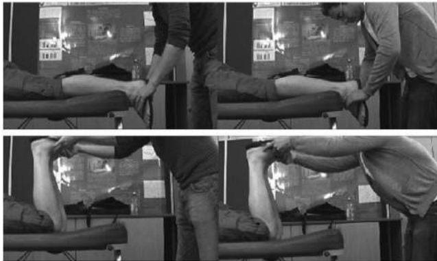
Fig 1. Example of comparison photos taken during a training session to evaluate consistency of procedure between examiners.